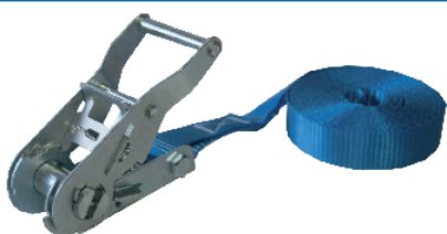
Art. 186 FASTY RATCHET STRAP

1 pce with hooks, W=25 mm, 2-parts (L=30 + 470 cm), 800 kg. Black