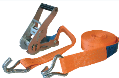
Art. 188 FASTY RATCHET STRAP

1 pce with hooks, W=25 mm, 2-parts (L=30 cm + 470 cm), 1000 kg. Blue