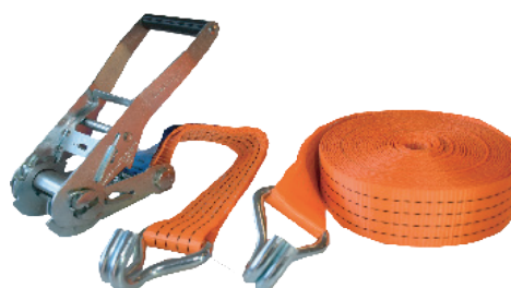
Art. 189 FASTY RATCHET STRAP

1 pce with hooks, W=35 mm, 2-parts (L=50 cm + 450 cm), 2500 kg. Orange