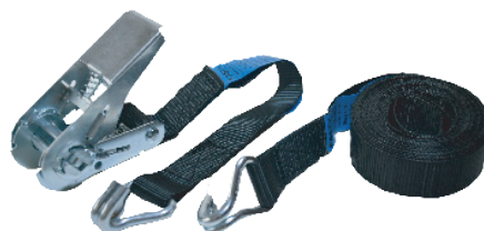
Art. 182 FASTY RATCHET STRAP

1 pce endless, W=25 mm, L=500 cm, 800 kg. Black