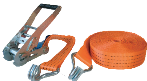
Art. 192 FASTY RATCHET STRAP

1 pce with hooks, W= 50 mm, 2-parts (L=50 cm + 950 cm), 4000 kg. Orange