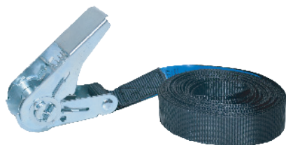
Art. 180 FASTY RATCHET STRAP

1 pce endless, W=25 mm, L=500 cm, 800 kg. Black