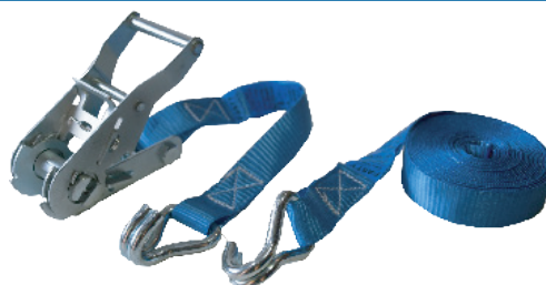
Art. 187 FASTY RATCHET STRAP

1 pce endless, W=25 mm, L=500 cm, 1000 kg. Blue